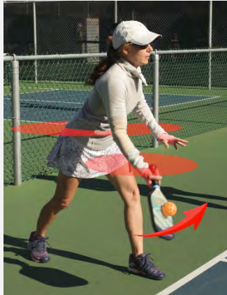
Figure 4-3 (legal serve)