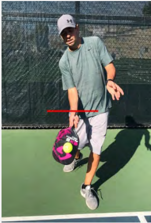
Figure 4-1 (legal serve)