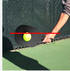
Figure 4-2 (illegal serve)